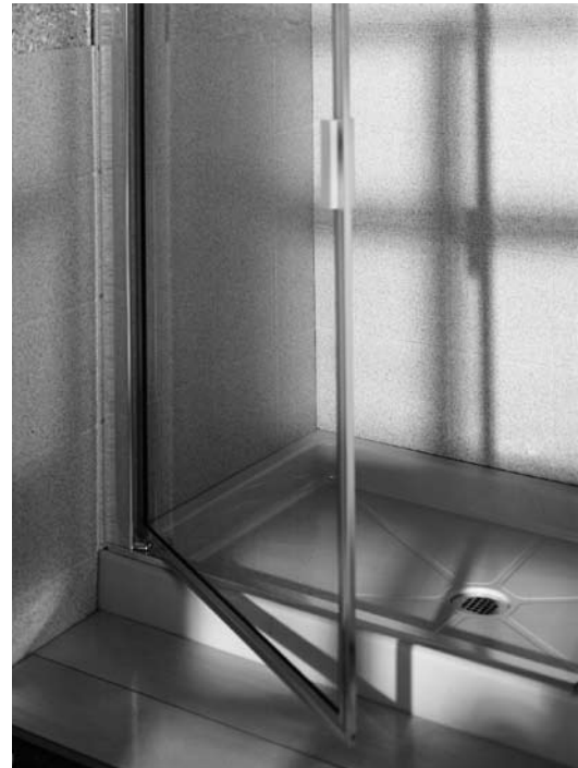
Shown with 4834.ST Shower Base and 4834.STE2 Shower Enclosure (not included)