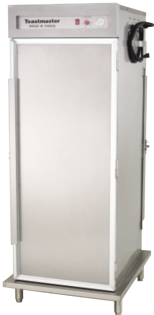
Shown with Optional Prison Package