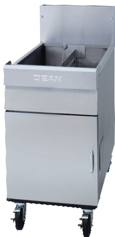
1824G flat-bottom fryer shown with optional pan divider, marine edge top cap and casters.