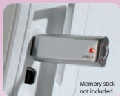
Memory stick not included.

Utilize the dual USB ports to import and export designs, save self-designed patterns, download machine updates or connect to your PC.