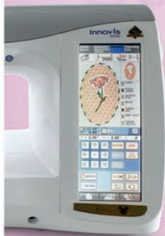
Extra-large, high resolution color LCD screen control panel