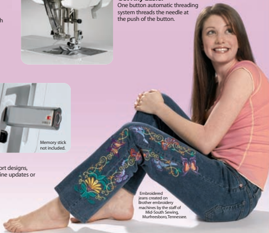
Embroidered jeans created on Brother embroidery machines by the staff of Mid-South Sewing, Murfreesboro, Tennessee.