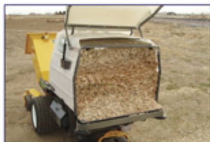
Catcher box fills completely with chipped material

E - Oscillating spout in catcher box evenly distributes material in the box and Powerfil® full signal lets the operator know when the box is full.