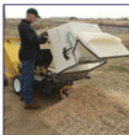
Maneuverable Walker Tractor allows material to be transported from job site